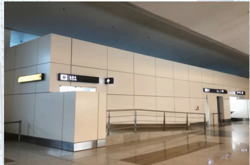
TERMINAL 3 WASHROOM, IGI AIRPORT DELHI