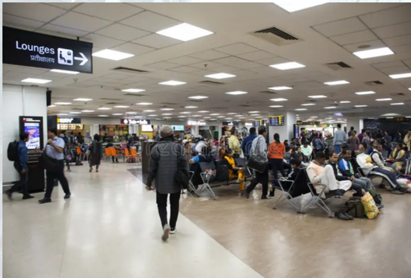
TERMINAL 2 EXTENSION, IGI AIRPORT DELHI