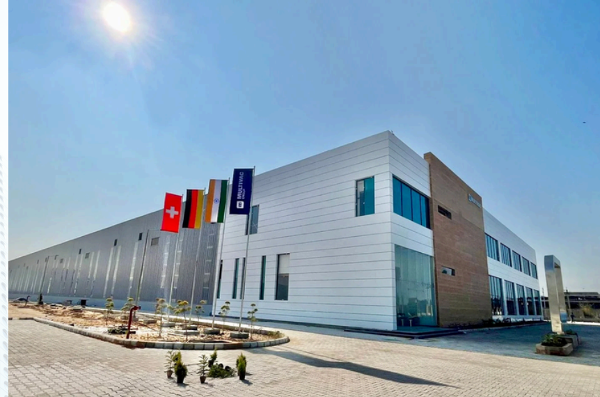
MULTIVAC LARON FACTORY, NEEMRANA