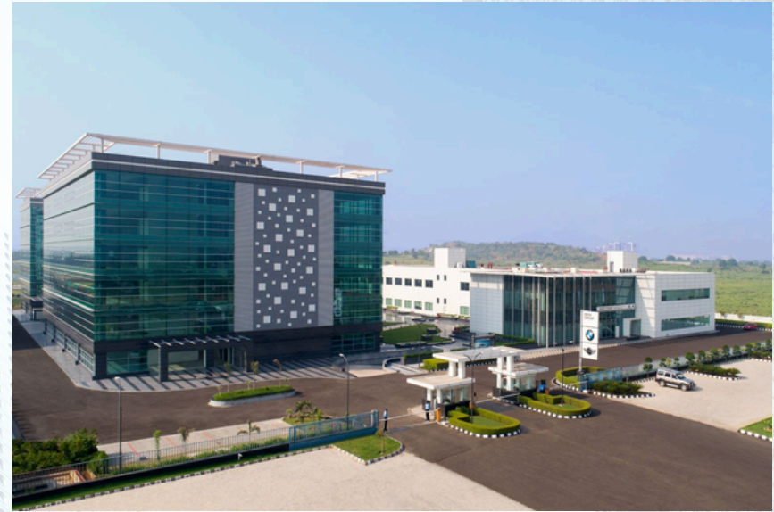
ITPL CORPORATE OFFICE, GURUGRAM