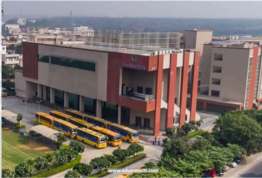
SHIV NADAR SCHOOL, GURUGRAM