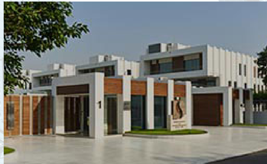
DS FLAVOUR DIVISION, NOIDA