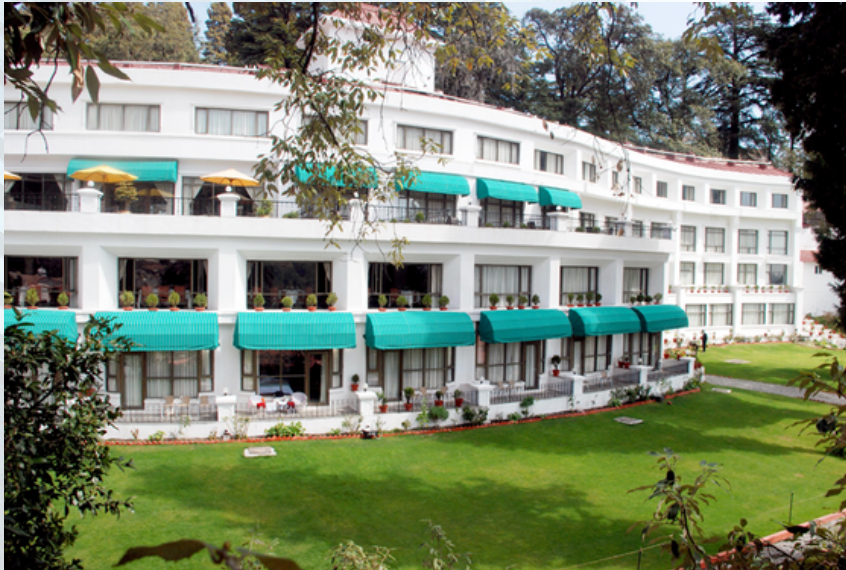
MANU MAHARANI HOTEL, NAINITAL