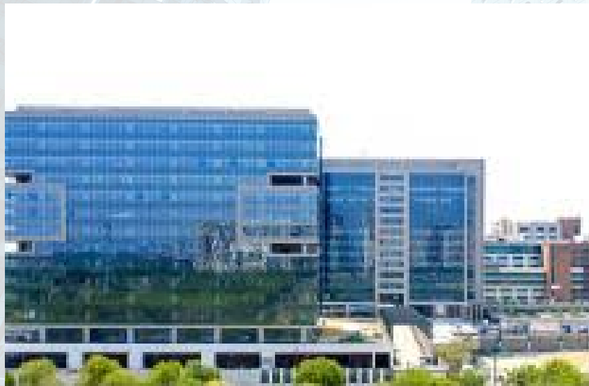
EMBASSY OXYGEN BUSINESS PARK, GREATER NOIDA